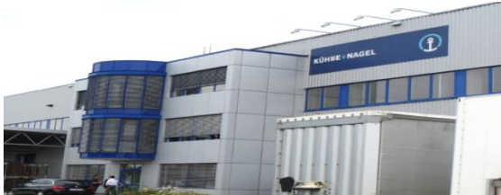
Straubing – Kühne + Nagel