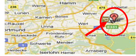
Neumarkt – Tchibo Logistic