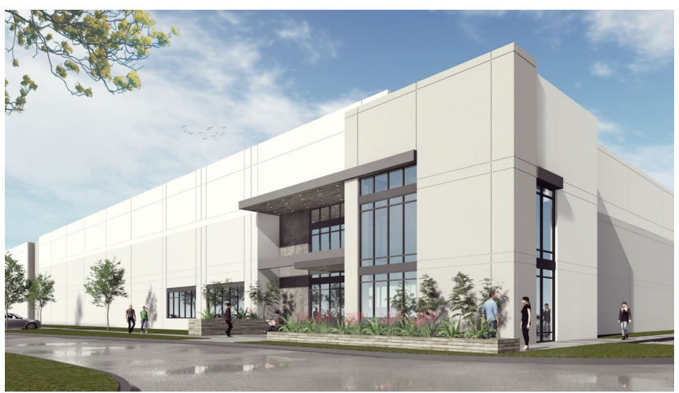
Rendering of 5005 Parker Henderson Road, Fort Worth, Texas

highway. The future speculative development of this property is anticipated to include a 605,000 SF state-of-the-art e-commerce and logistics facility, with 36' clear height, up to 260 trailer parking spaces and built-to-suit office. The project is expected to generate a development yield of approximately 6.3%.