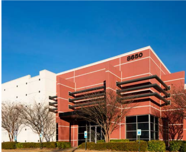
8650 Commerce Drive, Southaven, MS

The properties are located within established business parks and are strategically located near major e-commerce distribution infrastructure and benefit from access to extensive highway and major air and rail systems.