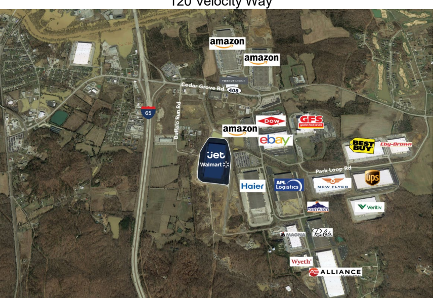
120 Velocity Way - aerial overview